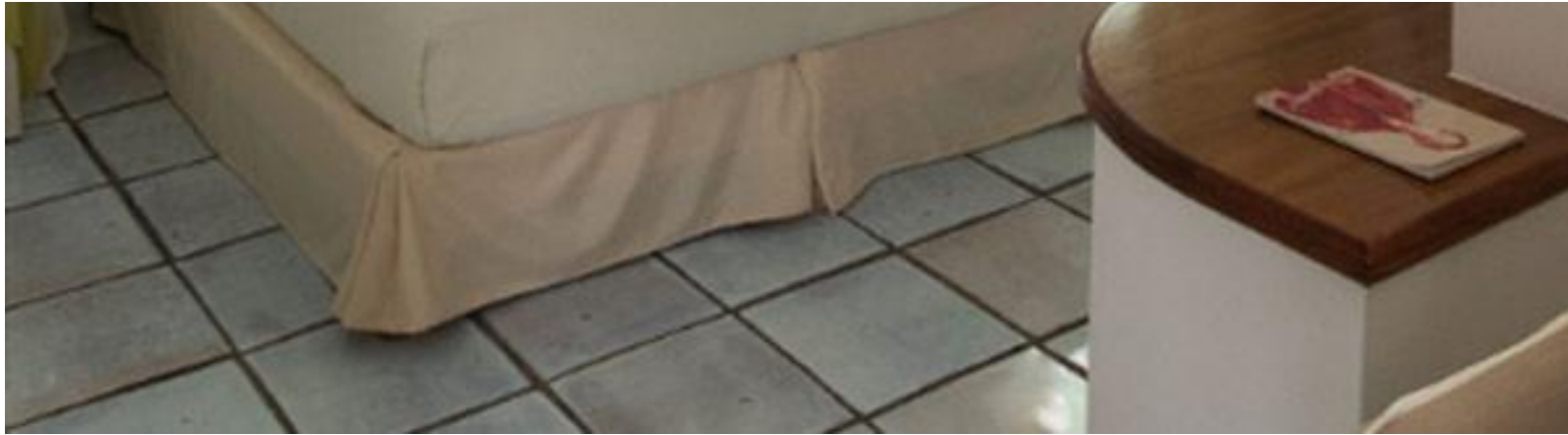
The country estate outside Monopoli is a place of simple beauty, echoing with past lives of noblemen and farmworkers.

If you're not kicking back by their pool, or making the most of the fact their chic apartments have two separate bathrooms, one at the top end of the space and the other at the bottom – my partner and I got such a kick out of having our own separate quarters, book yourself a lunch at the nearby Saleblu restaurant.