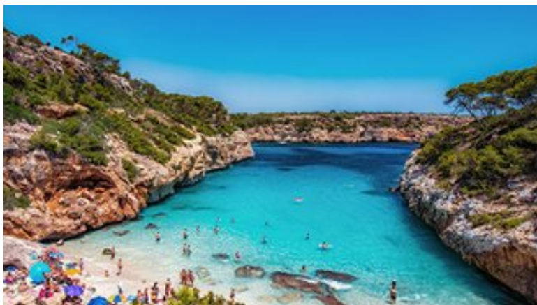
Mallorca, Spain: An insider guide to having your very own Love Island experience