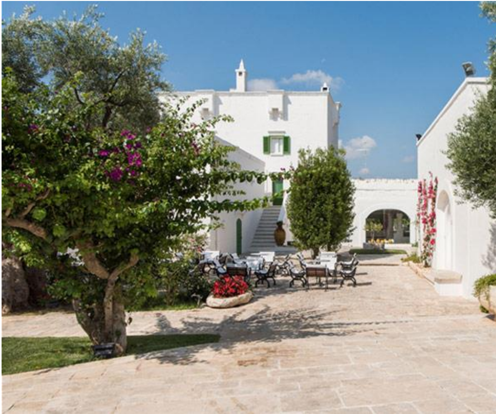
Il Melograno is renowned throughout Italy as the first masseria to open its doors to guests and reveal 400 years of history.