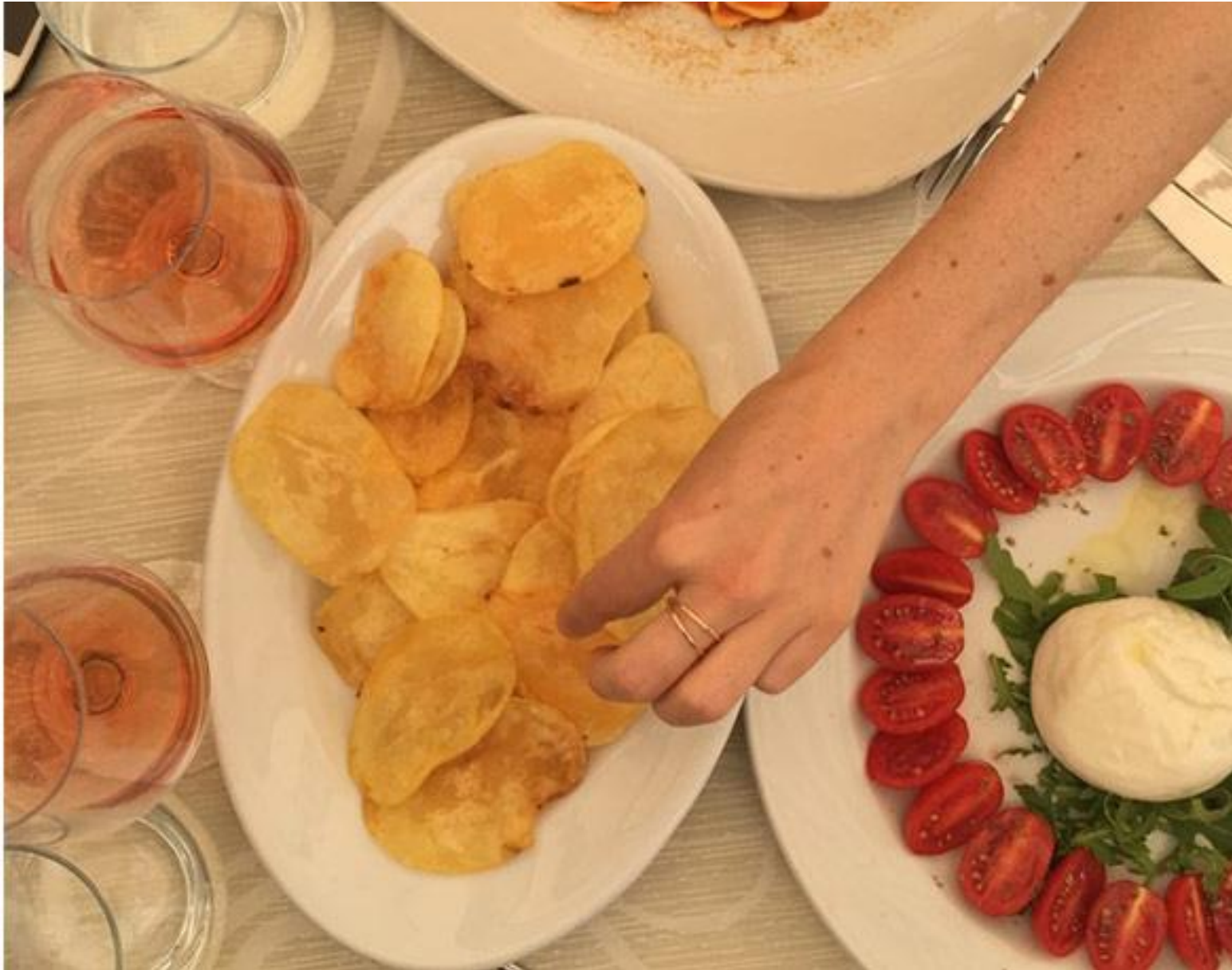
THIS was the meal of the trip.