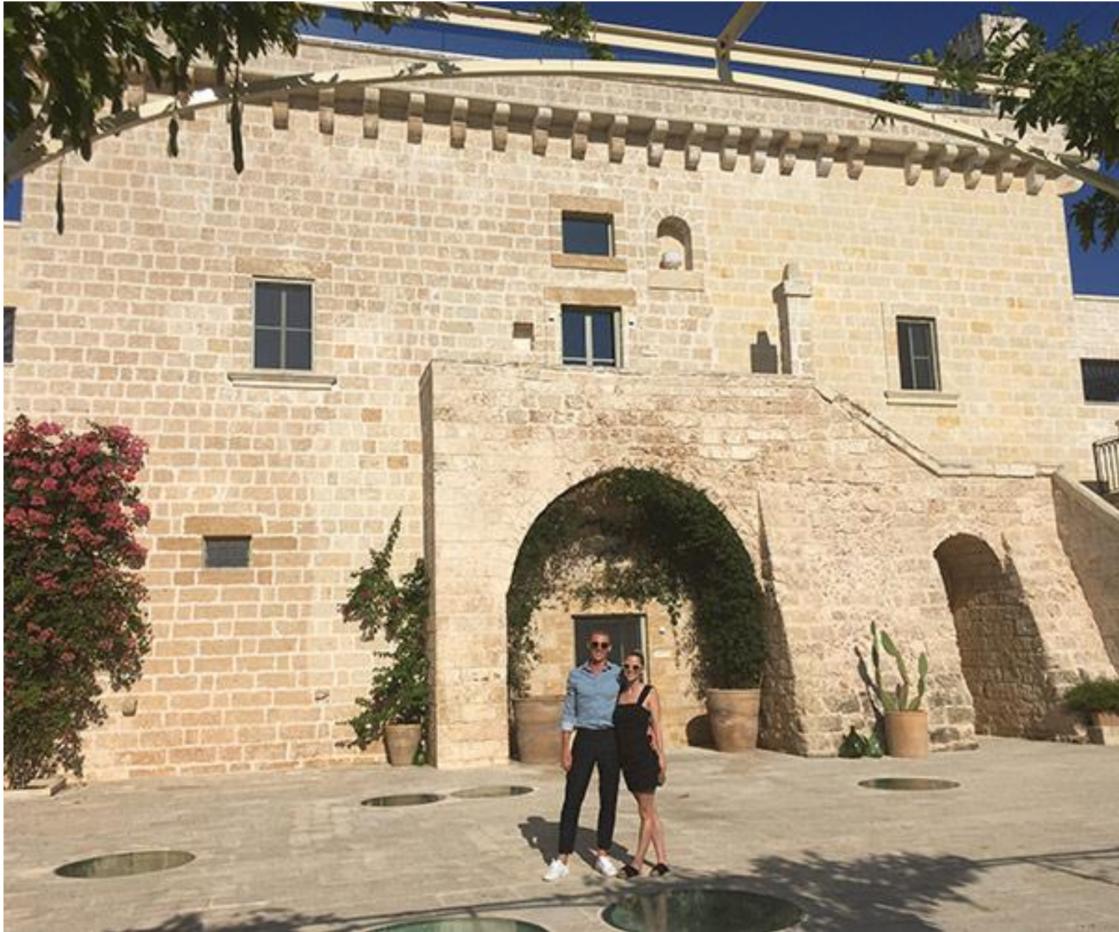
Seriously contemplating moving into Masseria Trapanà.