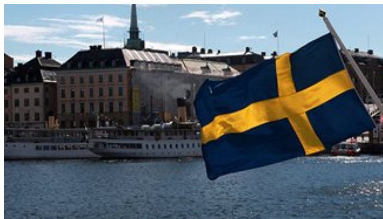
Why Stockholm is the cool Scandi capital you need to visit now