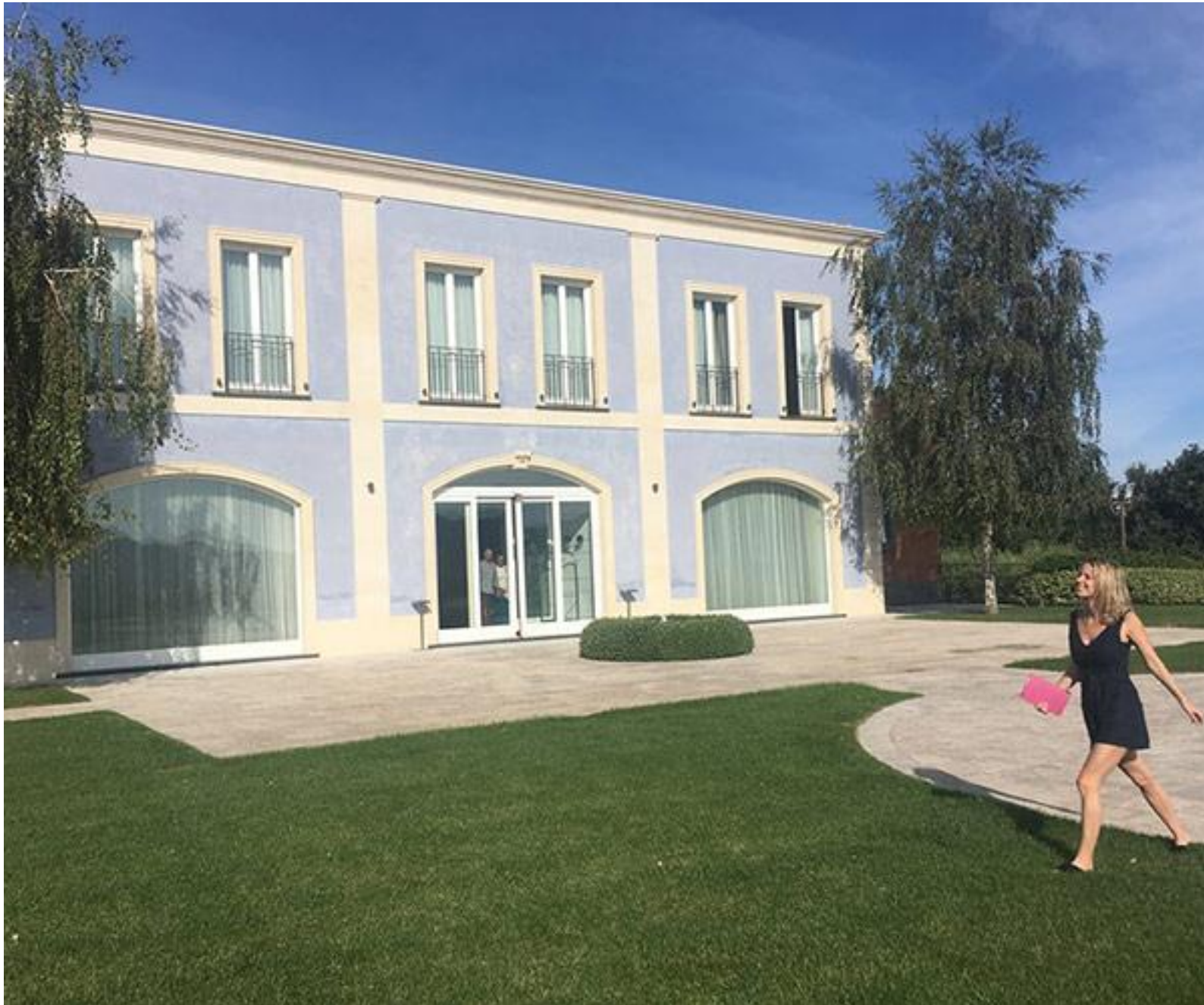
How charming is the facade of Villa Neri Resort and Spa?