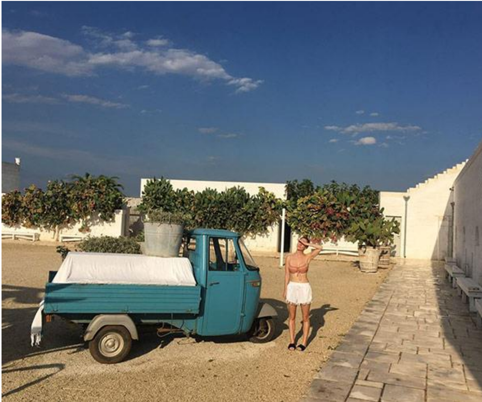
Taking in the enchanting settings of Masseria Potenti.